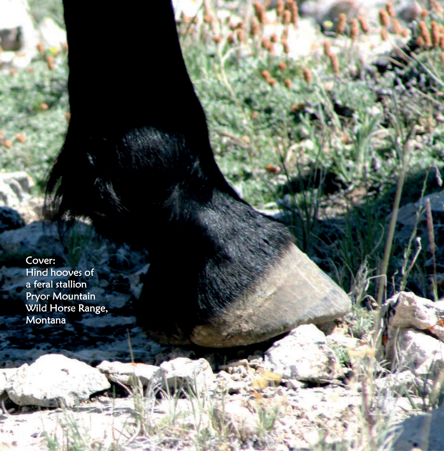
Cover: Hind hooves of a feral stallion Pryor Mountain Wild Horse Range, Montana